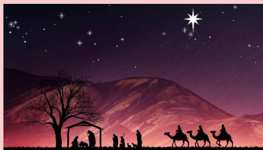
We Three Kings of Orient Are

The blue candles are lit on the first, second and fourth Sundays of Advent. The pink candle is lit on the third Sunday, also called Gaudete, which is a time to be joyful and celebrate the approach of Christmas. On Christmas Eve we light the white candle which represents purity and Christ. It is called the Christ Candle and is lit at our Christmas service.